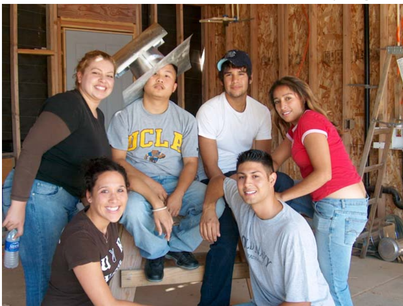
2006-2007 Interns at CCRH UC Davis Intern Institute. Students pictured here at Power Inn site (self-help project) in Sacramento, CA.